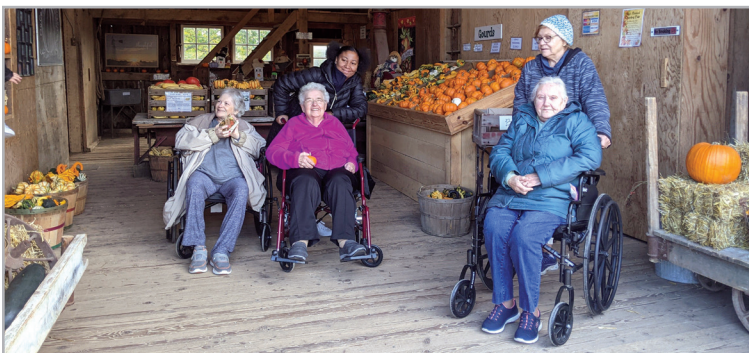
We had another beautiful day for our outing to the pumpkin farm.