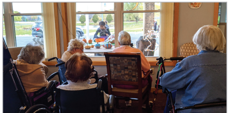
Hartford Business Trick or Treat