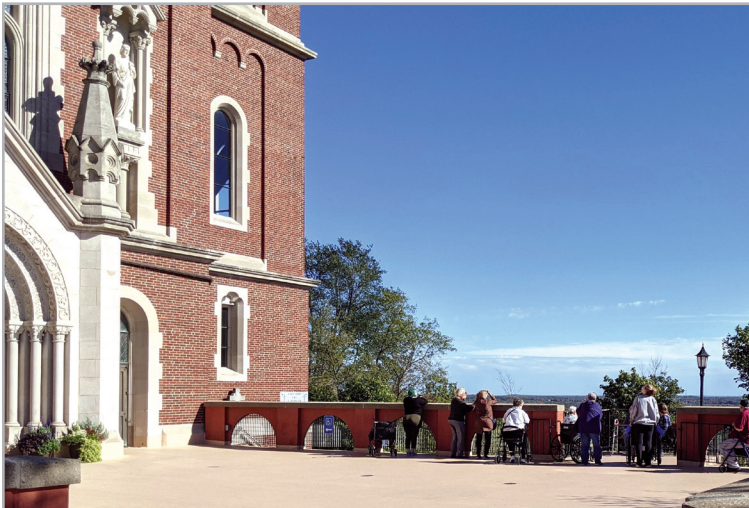
Our group could see all the way to the Milwaukee skyline from Holy Hill.

We are still accepting donations to try and meet our team goal of $2000 for the Walk to End Alzheimer's. Goo downloaded their mobile app so it's super easy to deposit even paper checks into our team fund if you write a check to Alzheimer's Association. Or you can donate safely and securely at bit.ly/3DEJhtq .