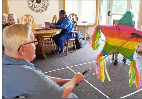
Cinco de Mayo celebration included fun with a pinata.