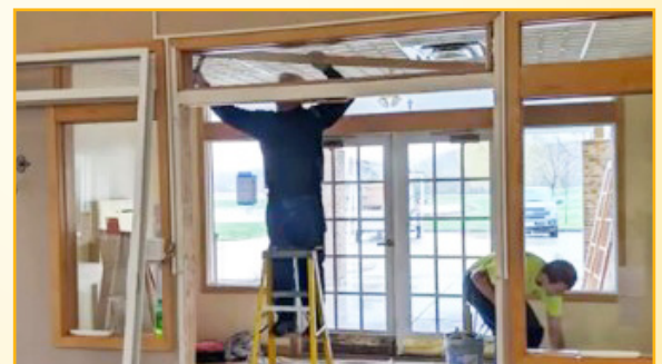
Residents are happy with the automatic opening doors