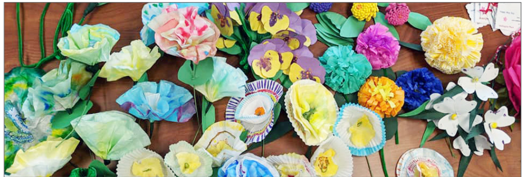
Impressive flower creations for our May Baskets

Elaine K. has been released from Physical Therapy and we are happy that she is sharing what she learned and is helping to lead some of the exercises for us in group.