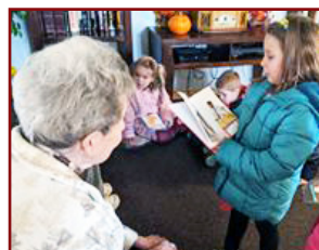
Friess Lake first grade readers