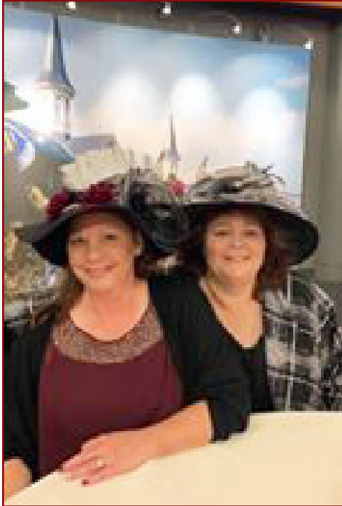
Our fearless leaders enjoying Kentucky Derby traditions at Carriage Healthcare's semi-annual continuing education conference held in Louisville.