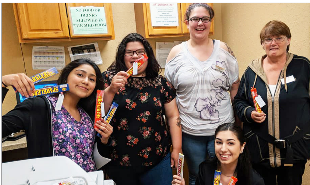
CNA Appreciation Week