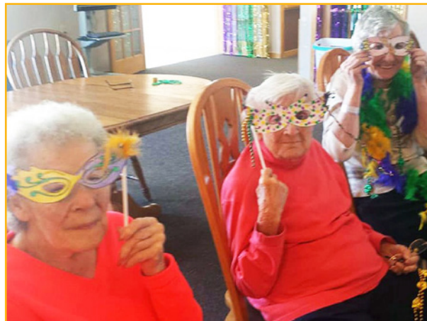
Celebrating Mardi Gras

A group enjoyed an outing to the Shamrock, at Fair Park inside the county fairgrounds for St. Patrick's Day.