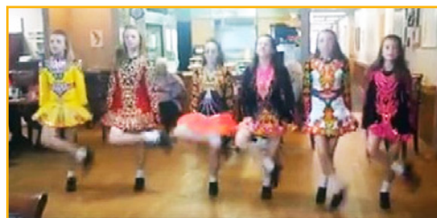
Trinity Irish Dancers performed for a dinnertime show.