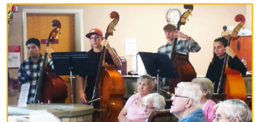
Hartford Union HS Orchestra gave a private concert for our residents.